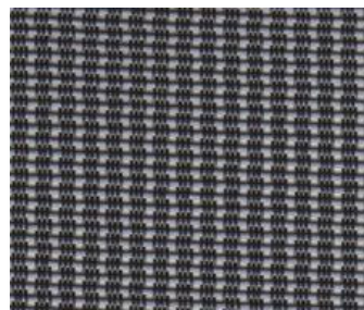
V02 NINJA GREY