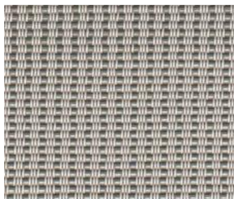
Q19 HONEY SAGE