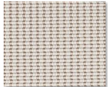
Q01 MUSHROOM SAND