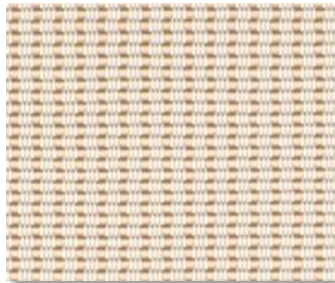
Q02 CUSTARD CREAM