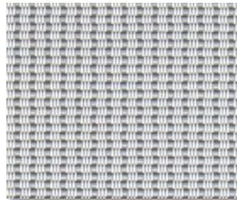
V01 PALE GREY