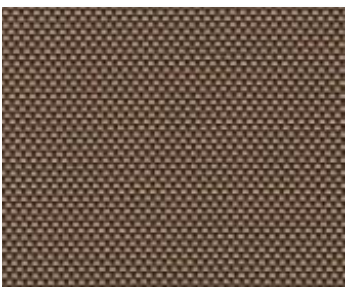
035071 CHARCOAL/ APRICOT