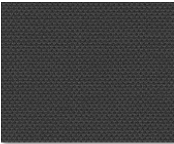
035035 CHARCOAL/ CHARCOAL