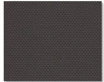
035032 CHARCOAL/ COCOA